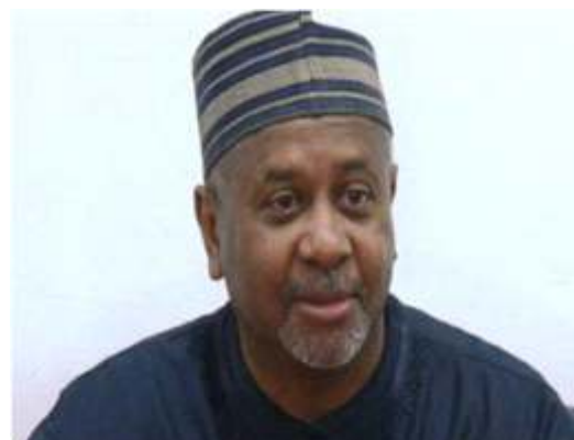
Colonel Sambo Dasuki, National Security Adviser to President Goodluck Jonathan

Procurement monitors have stated that the NSA failed to show how release of details on public expenditure,