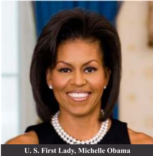
U. S. First Lady, Michelle Obama

Air Force documents obtained after a law suit filed by Judicial Watch, Inc. following an FOI request, revealed that Michelle Obama, her daughters and their entourage cost