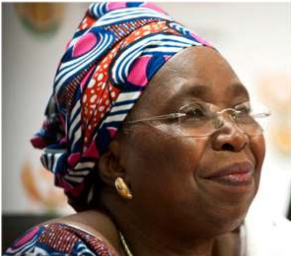
Dr Nkosazana Dlamini-Zuma African Union Commission (AUC) Chairperson

S takeholders on the African continent and their international partners met in Johannesburg, South Africa, on August 5 and 6, 2014, to finalize the text of an African Declaration on Internet Rights and Freedoms, a Pan African initiative to promote human rights online, which also reaffirms