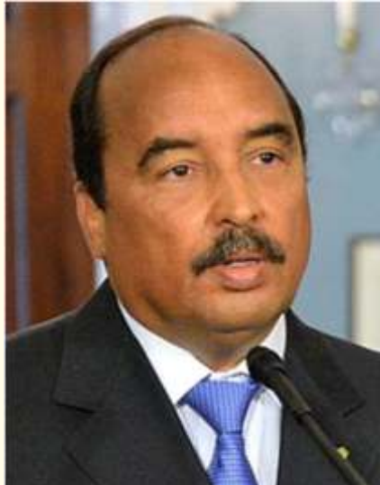
Mohamed Ould Abdel Aziz Chairman of the African Union

The Declaration notes that "The internet offers new opportunities to access official information, and for governments to communicate with people, through the use of open data. Open data and new forms of online consultation can empower people to take a more active part in public affairs."